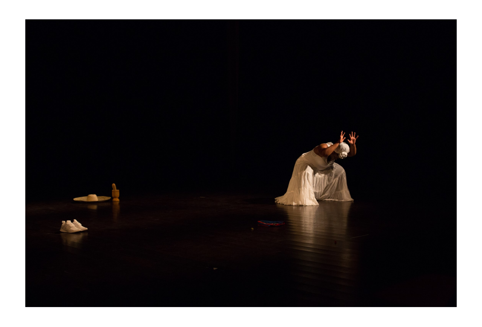
Istwa A Twò Lòng. The story is too long to tell in one lifetime

A work of collective healing across space and time.